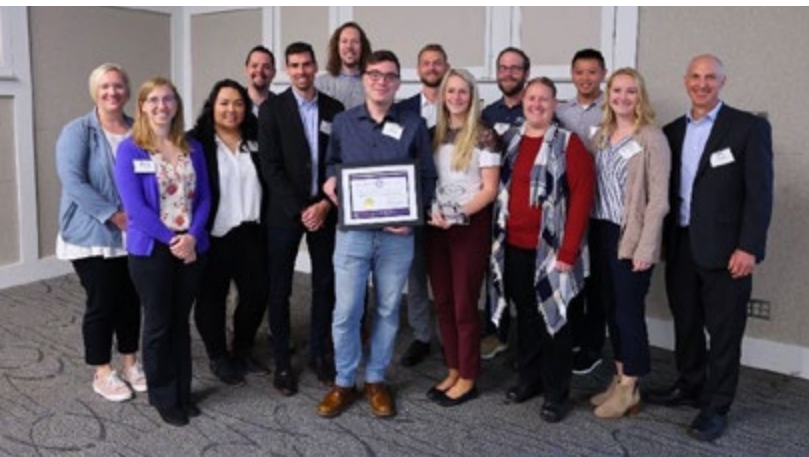
Boston Scientific staff pose with the Manufacturer of the Year Award

The Manufacturers Alliance differentiates itself from other associations by relying on collaborations with a wide variety of valued resources rather than government, academia, or consulting for financial support. Since its inception, the Alliance has enrolled entire companies instead of individuals, with the goal of affecting the whole enterprise. This unique approach draws primarily from peer-to-peer experiential learning.