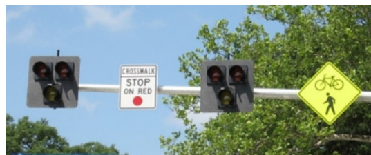
Example of a potential crossing signal. Final design may vary.