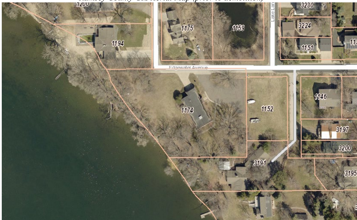
Ramsey County GIS Aerial Map (prior to demolition)