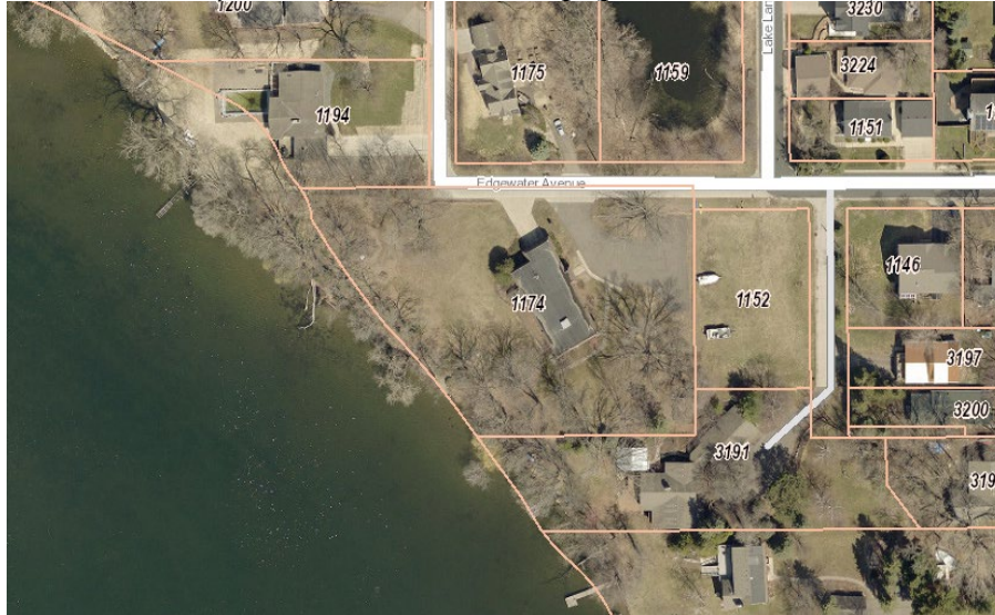
Ramsey County GIS Aerial Map (prior to demolition)

recommending the side yard setback as measured from the south property line for Tract A shall be 10 feet. This has been added to the draft conditions of approval outlined in the New Business Memo.