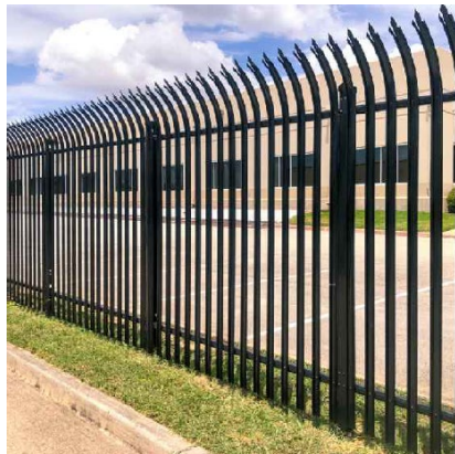
Decorative Metal Fence with Spikes

The decorative metal fencing with spikes would include two gates, one across Paul Kirkwold Drive, approximately 200 feet in from Hamline Avenue and another across the entrance to the main entrance of the building. The decorative metal fencing with spikes would connect to existing fencing on the east side of the Subject Property and the vinyl coated chain link fence with barbed wire would connect to existing barbed wire chain link fencing on the southwest corner of the Subject Property. The existing barbed wire chain link fence is on the federal government property which is exempt from local zoning and other regulations.