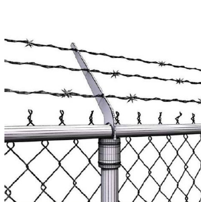
Chain Link Fence with Barbed Wire