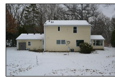
REAR OF 4073 VALENTINE COURT CITY OF ARDEN HILLS, RAMSEY COUNTY, MINNESOTA.

LOT 11 = 37,541 SQ. FT. PROPOSED GARAGE ADDITION = 339 SQ. FT. PROPOSED DRIVEWAY = 240 SQ. FT. EXISTING HOUSE FOOTPRINT = 1,363 SQ. FT. EXISTING REAR CONCRETE PAD = 45 SQ. FT. EXISTING SHED FOOTPRINT = 123 SQ. FT. TOTAL PROPOSED IMPERVIOUS SURFACE COVERAGE = 2,839 SQ. FT. (7.56% OF LOT AREA)