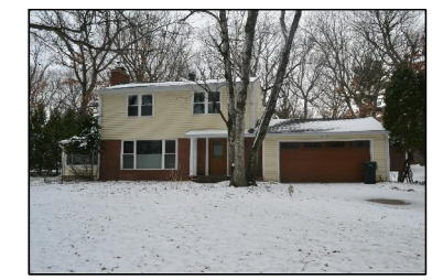
FRONT OF 4073 VALENTINE COURT, CITY OF ARDEN HILLS, RAMSEY COUNTY, MINNESOTA.