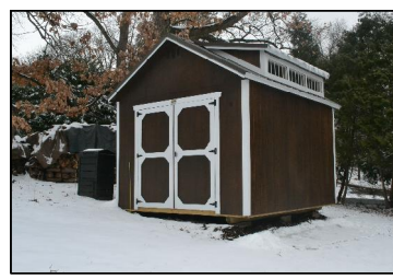
SHED AT 4073 VALENTINE COURT CITY OF ARDEN HILLS, RAMSEY COUNTY, MINNESOTA.