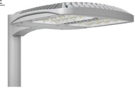
"L31" & "L34" LIGHT STYLE

Provide light fixtures as shown on Fixture Schedule. Substitutions shall have prior approval by the Project Engineer before bid date. Being listed as an acceptable Manufacturer in no way relieves the Contractors obligation to provide all equipment and features in accordance with these specifications.