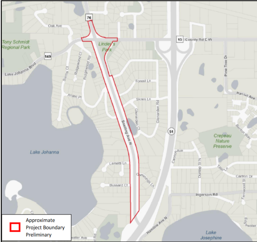
2020 OLD SNELLING AVENUE and COUNTY ROAD E IMPROVEMENTS PROJECT PRELIMINARY MAP