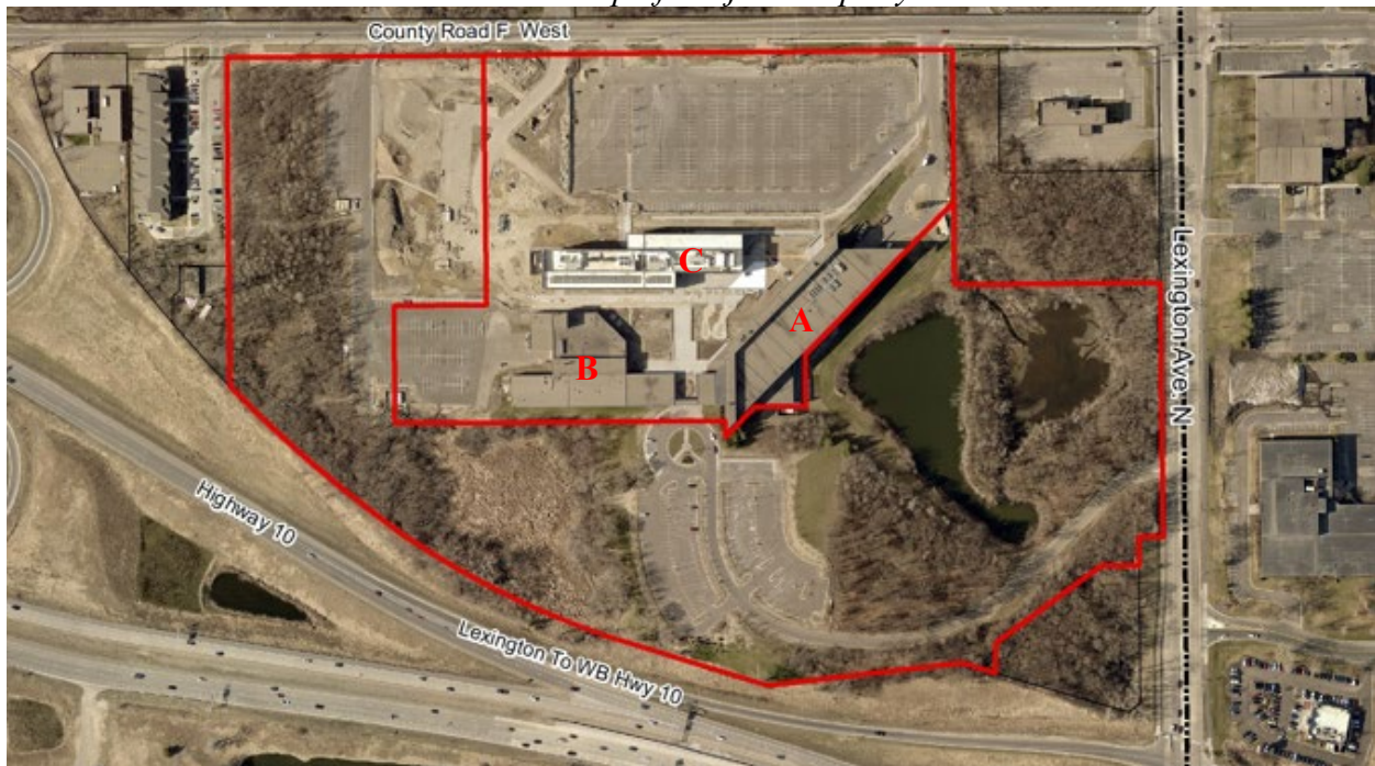
Aerial Map of Subject Property

All of the auxiliary and freestanding signs as approved under the 2018 Master Sign Plan have been installed on the Subject Property. As part of this sign proposal, the Applicant is requesting to install a second nonilluminated freestanding monument sign along Lexington Avenue with up to 11.68 square feet of sign copy area and a total sign area of 33.36 square feet that includes directional signage. The proposed freestanding monument sign would be located 244 feet north of the existing Land O'Lakes sign.