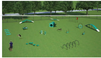
Complete System $19,646.00