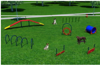
Gold Package $7,738.00